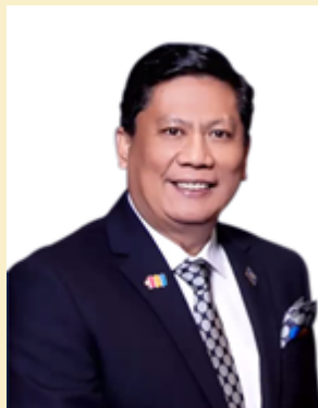
RODEL RIEZL S. REYES DISTRICT GOVERNOR DISTRICT 3860